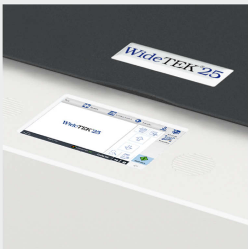
Large color touchscreen for simplified operation