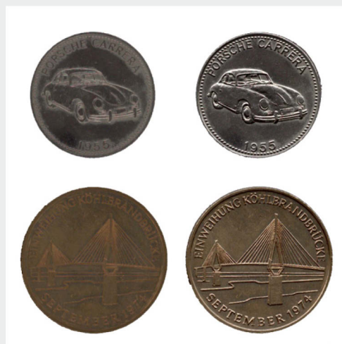
2D scan versus 3D scan, capture all details