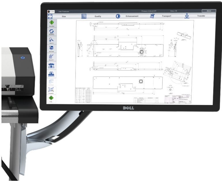
Full HD monitor with adjustable monitor arm mounted to the side of a WT36/48/60-STAND