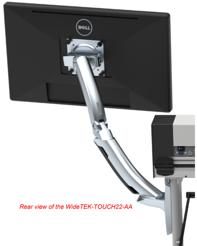
Rear view of the WideTEK-TOUCH22-AA